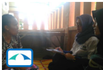
The business model of trust